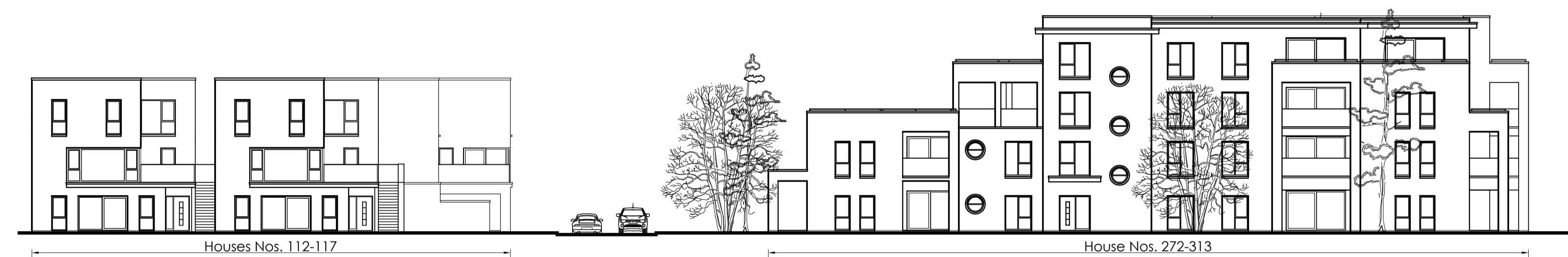
■ Contiguous Elevation No. 22B