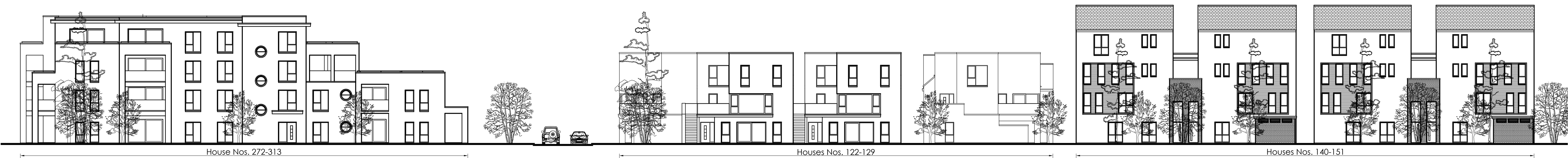
■ Contiguous Elevation No. 19