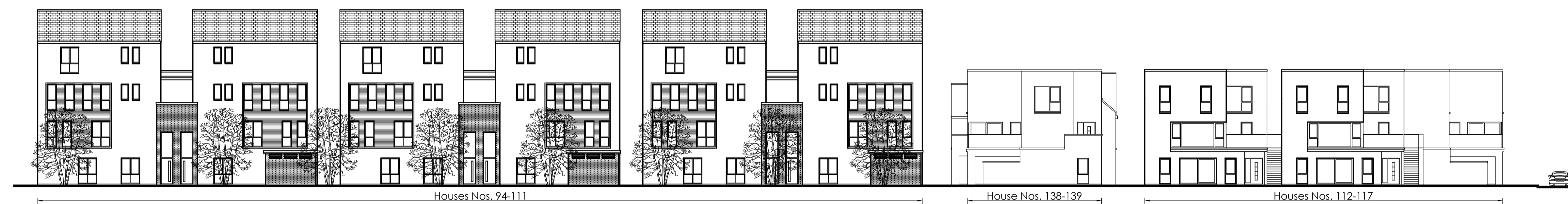
■ Contiguous Elevation No. 22A